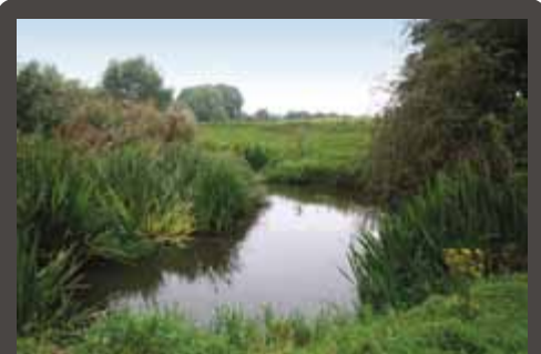
The River Wheelock flows northwards and into the River Dane at Middlewich.