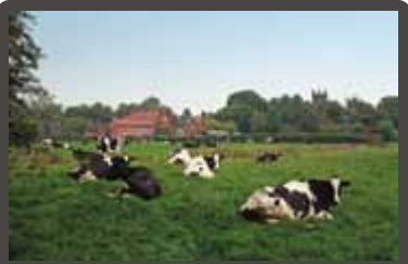
Warmingham village from the west.