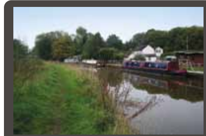
The Trent & Mersey Canal runs for 93 miles from Preston Brook near Runcorn to Shardlow near Derby. It opened in 1777.